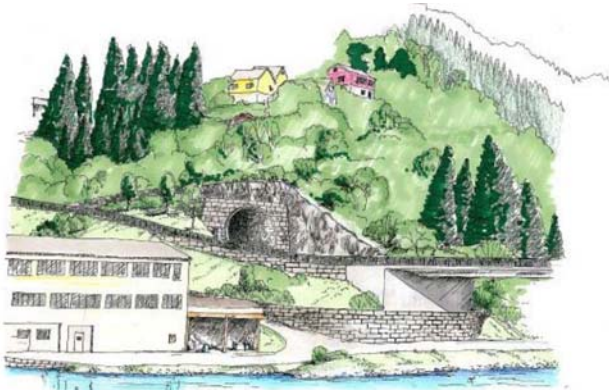
Tunnelindgang og den nye bro i Kårvika ved Lonevåg