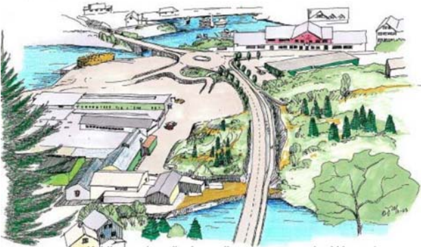
Kobling med rundkøring mellem ny og gammel vej i Lonevåg

Address: ÍSTAK Ltd. Engjateigur 7 105, Reykjavík, Iceland